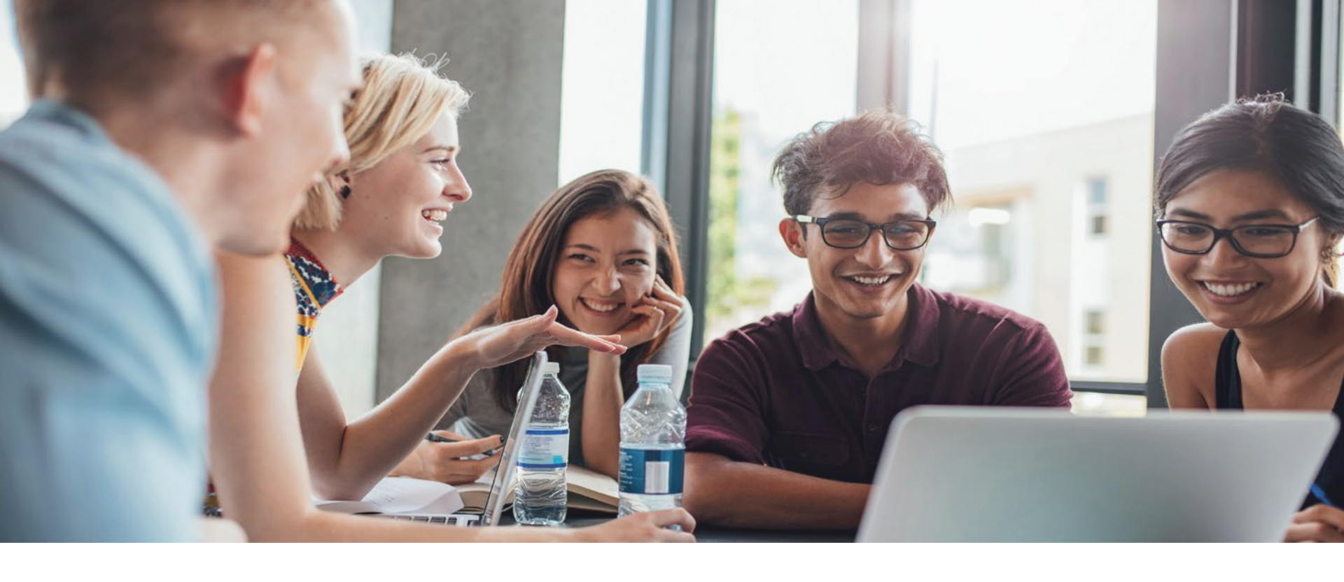
Thank you for your attention @